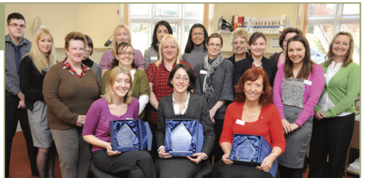
PRIZED ASSETS: Our ESR project team pictured with their trophies of success following the NHS West Midlands event.

"Our vision has always been to embrace ESR and to maximise the benefits of the system. We have sought to